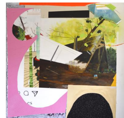
715 pm es, acrylic, colored pencil, ink, flashe, paint pen, spray paint, glitter on canvas, 66” x 66”, 2018.