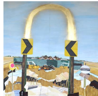
Miscalibration: Sacred Profane , acrylic, colored pencil, ink, flashe, paint pen, glitter on canvas, 72” x 72”. 2019.