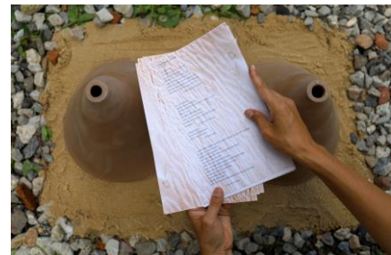
Alva Mooses, culebra, trueno, tormenta , terracotta, screen-printed banners, riso-printed poems written by the artist, 2021. Dimensions variable.