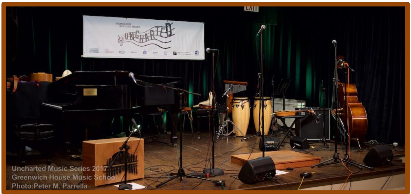
The hall set up for a typical concert